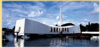
Rotary Club of Pearl Harbor